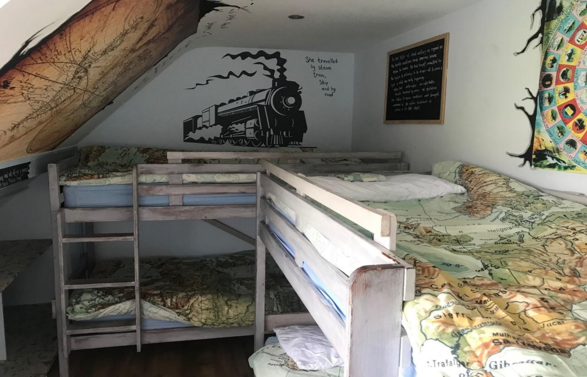
Rooms of 6 or 4. Boys and Girls separate. Room mates allocated and announced at the time.