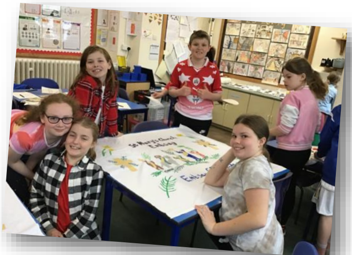
Making a banner in art for St Mary's Church

As you can see, we've managed to fit a lot into another short term. Next term our topic will be coasts and will include our residential trip to Robin Hood's Bay!